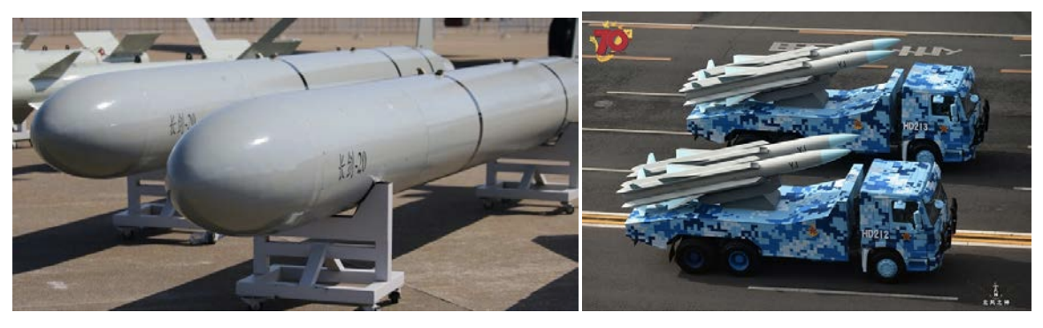
(Left: Chinese Changjian-20 (CJ-20) Land-Attack Cruise Missiles (LACM). Right: PLAN Yingji-12A (YJ-12A) supersonic anti-ship missile unveiled during victory day parade in 2015.)

warhead capabilities, such as the 1,500 km–range CJ-20 LACM, supersonic YJ-12, and the YJ-18 ASCM.<sup>62</sup> THAAD and PAC-3 units are insufficient because any Chinese attack could overwhelm the small number of available interceptors. To remedy this discrepancy, the Department of Defense (DoD) could consider a mix of medium-range kinetic and non-kinetic defenses, adding Indirect Fire Protection Capability (IFPC) Increment 2-1, 400 kW lasers, Surface Electronic Warfare Improvement Programs (SEWIP) Block 3, and HPM broadband systems to strengthen Guam's intercept capabilities.<sup>63</sup> The IFPC Increment Block 2 protects against unmanned aerial vehicles (UAVs) and cruise missiles, and it blocks against smaller and faster threats through its counter-rocket and counter-mortar capabilities.<sup>64</sup> Therefore, active defense efforts should be coupled with passive defenses, such as the dispersal of combat aircraft across a larger number of bases, and other steps such as burying fuel lines, training in rapid runway repair, and deception and camouflage.