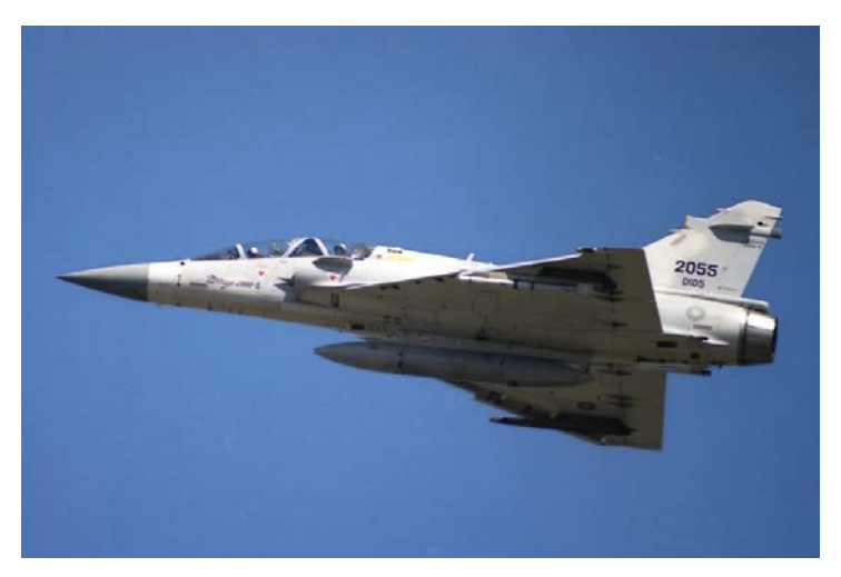
(A Taiwanese Mirage 2000-5Di fighter.)

For its part, the U.S. Air Force is pursuing a more modest and selective effort to harden its bases and increase its airfield damage repair capabilities in Asia. This includes a number of efforts in concert with the other services to ensure continuous and credible forward operations. The QDR calls for the capability to disperse land-based forces to other bases and operating sites, and for the ability to operate and maintain frontline combat aircraft from austere bases with only a small amount of logistical and support personnel and equipment.<sup>80</sup> A key initiative of the former Pacific Air Forces (PACAF) Commander General Herbert J. Carlisle was to find ways to disperse aircraft and to land