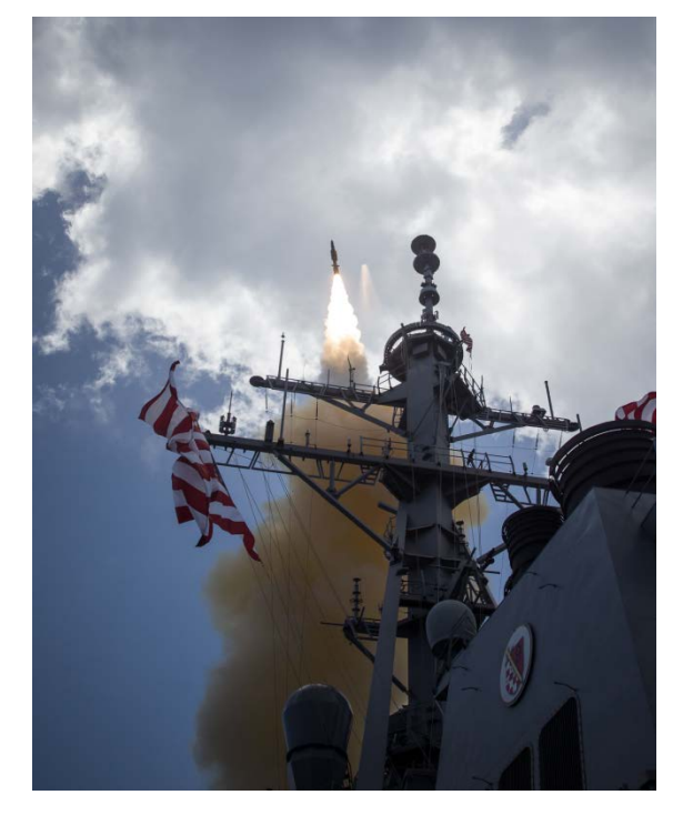
(Launch of SM-3 missile on U.S. Aegis ship.)

However, U.S. air bases are still not adequately protected. Even those bases that have significant active defenses are still vulnerable to saturation attacks. Andersen Air Force Base, with its long runways, large parking ramps, and vulnerable fuel storage areas, desperately needs hardening. For example, the THAAD and PAC-3 systems do little to protect Guam against potential Chinese missiles with supersonic and maneuverable