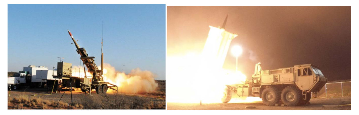
(Left: Launch of a U.S. Patriot Advanced Capability-3 (PAC-3) missile. Right: Launch of a U.S. Terminal High-Altitude Area Defense (THAAD) missile.)

In a conflict, active defenses buy time for the United States to decide how to most effectively use its airpower. They also allow the National Command Authority to determine the most effective course of war fighting when an adversary is willing to strike American or allied forces and territory with missiles.<sup>61</sup> Lastly, increasing active defenses decreases the likelihood an adversary will use force at lower levels of conflict. It decreases the effectiveness of such moves and thus acts as a deterrent. In this way, the improvement of active defenses is inherently stabilizing.