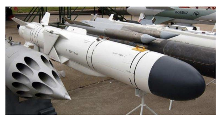
(Chinese Yingji-18 (YJ-18) anti-ship cruise missile.)

For its part, the Republic of China Air Force (ROCAF) in Taiwan has sought to balance its active and passive defenses against a Chinese missile attack—an upgrade to the U.S. approach that emphasizes active defenses over passive.<sup>65</sup> In terms of active defense, Taiwan has been investing heavily in BMD, as well as defense systems for "air-breathing" targets such as cruise missiles, fighters, bombers, and UAVs to diminish the coercive utility of China's military buildup. Taiwan currently has three Patriot missile batteries (or fire units) deployed around its capital, Taipei, and six more batteries for overlapping coverage over central and southern Taiwan. Taiwan has also acquired a tenth Patriot battery to be kept on training and reserve status. All of these systems will be PAC-3