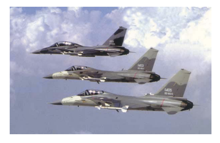
(Three F-CK Ching-Kuo Indigenous Defense Fighters (IDF).)

practices the rapid dispersal of its aircraft operations to move key units, which are usually concentrated in limited areas, to reduce vulnerabilities. Moreover, Taiwan uses the employment of airfield camouflage and deception techniques to confuse the PLA's reconnaissance and operational planning communities. However, the ROCAF still lacks sufficient capability to protect Taiwan against PLA fighters. For example, some ROCAF fighters, such as the F-CK and Mirage 2000, can only engage one PLA fighter at a time, so the PLA's numerical superiority is a concern for ROCAF loss rates.<sup>79</sup>