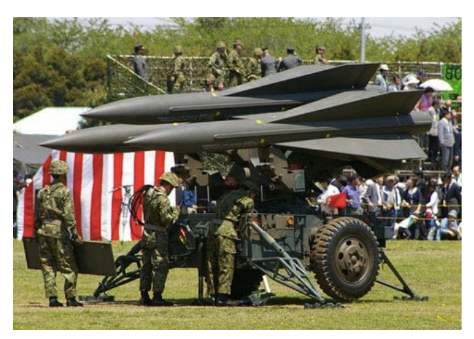
(MIM-23 Hawk medium-range surface-to-air missile on display. Source: CopyBook)

(Taiwan's Tien-Kung III (Sky Bow III) Surface-to-Air Missile System. Source: Army-Technology.com)