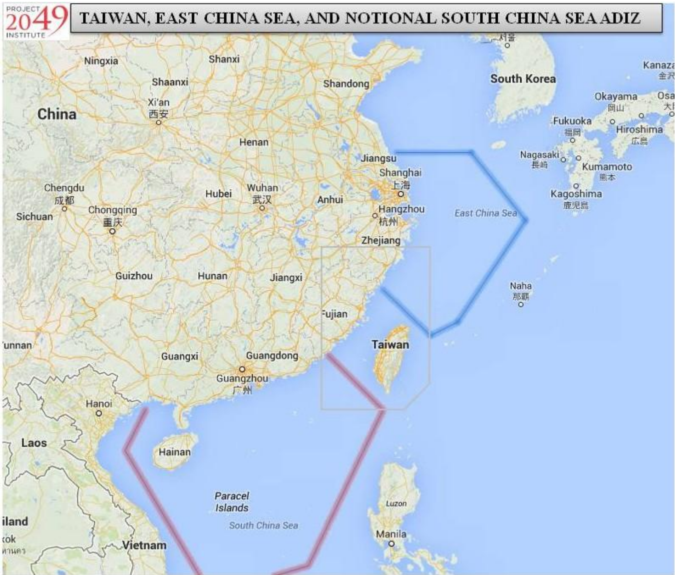
Figure 5: Taiwan, East China Sea, and Notional South China Sea ADIZ

The PLA has made significant advances in its joint air surveillance capabilities. PRC's announcement in November 2013 noted the potential for subsequent air defense identification zones in the future. While