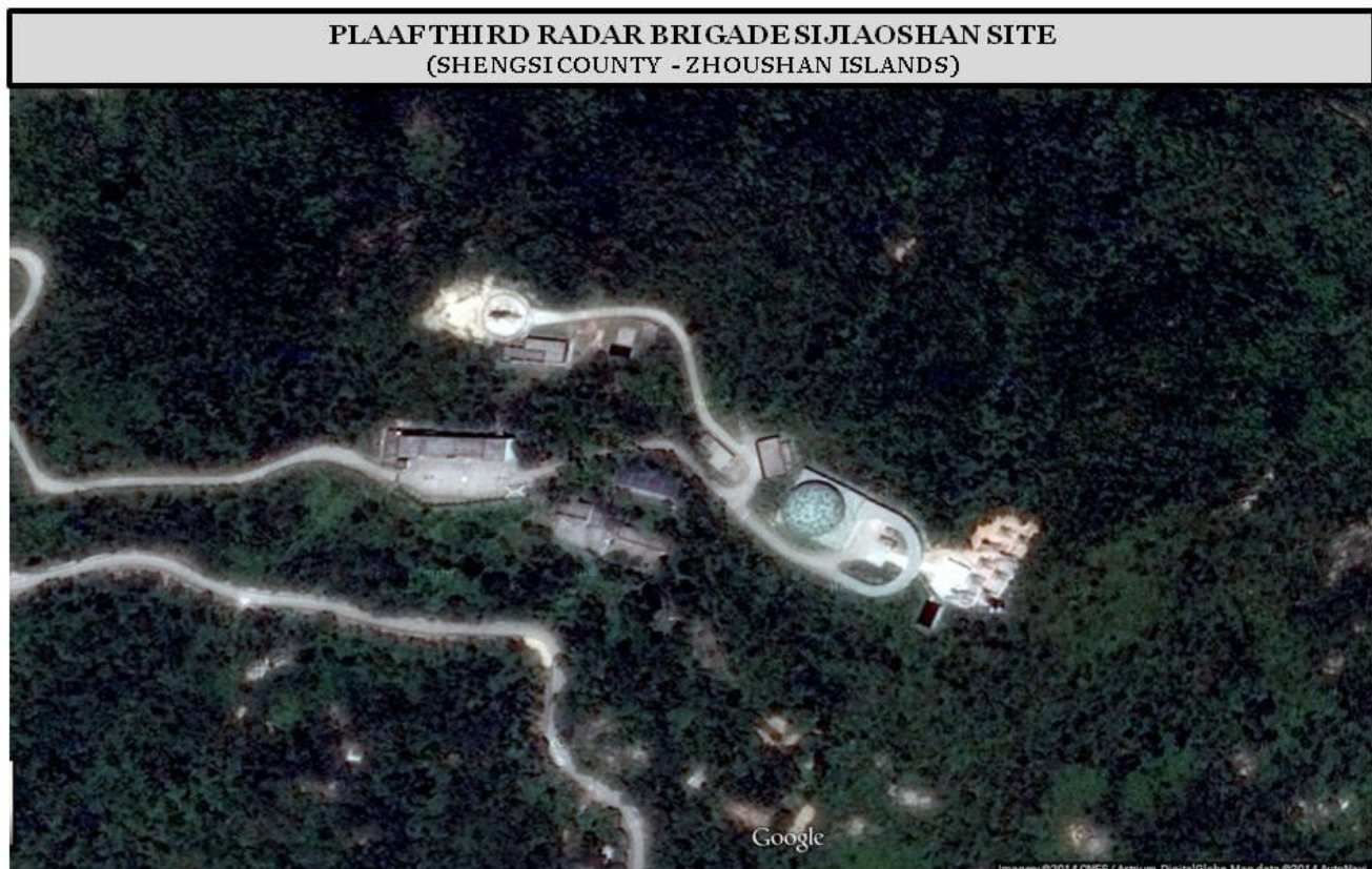
Figure 2: PLAAF Third Radar Brigade Sijiaoshan Site

Beyond sovereignty and territorial interests and policy changes in civil-military national airspace management, the ADIZ announcement culminated years of PLA investment into improved joint air surveillance. The relevance of radar and other sensors can be illustrated through use of the term air defense identification zone. Cooperative aircraft, such as