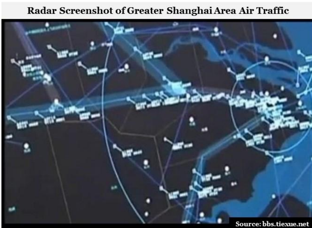
Figure 1: Radars of Greater Shanghai Area Air Traffic

At the national level, airspace management policy is under the purview of a vice premier and the State Air Traffic Control Commission (SATCC). 9 Although nominally under State Council control and with the participation of the Civil Aviation Administration of China (CAAC), the SATCC Office that manages daily airspace management affairs resides within the GSD Operations Department. 10 The same PLA department also is responsible for strategic